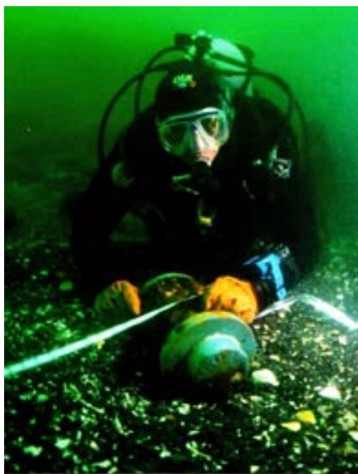
Archaeologist documenting the ship's wheel hub. The bronze hub is engraved with the name of the ship, Kad'yak, in Cyrillic letters.

In 2003, the wreck was located, and in 2004 an archaeological survey conducted, funded by NOAA and the National Science Foundation, but with the assistance of scores of organizations, profes-