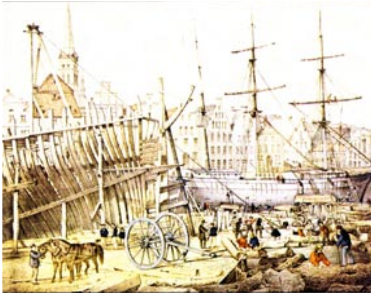
The shipyard in Lubeck, Germany where the Kad'yak was built.

The ice was cut from December to February. The Russian American Company also sent furs, timber, dried and salted fish, and tallow candles for trade in California. In return they bought flour, corned beef, and other provisions unavailable in Alaska.