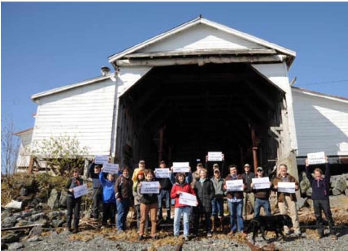
Supporting the federal Save America's Treasures program on a sunny April day. For more information, and photos from around the country, visit the National Trust for Historic Preservation at www.preservationnation.org.

www.sitkamaritime.org heritage@sitkamaritime.org